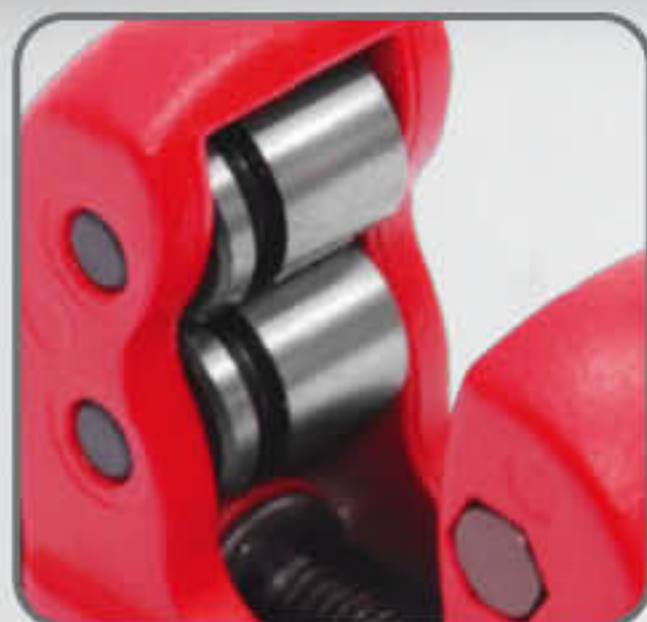
2 Rollers for a better fastening of the pipe.