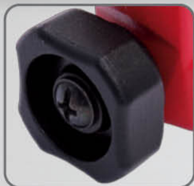
Spare cutting wheel in knob.