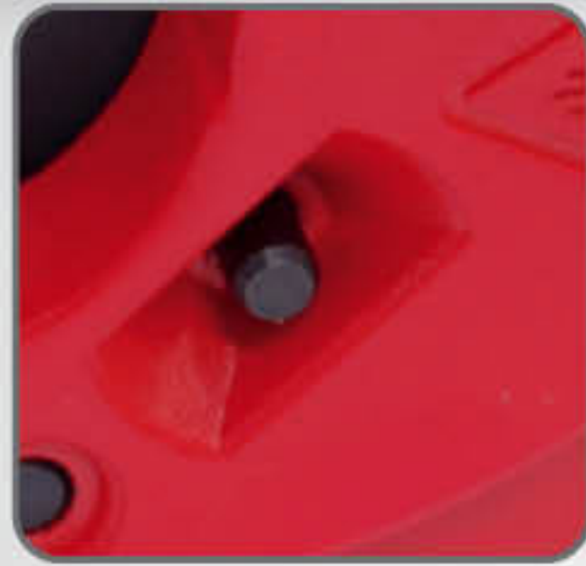
No tool required for instant blade change.