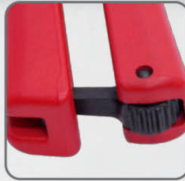
Automatic blade release system.