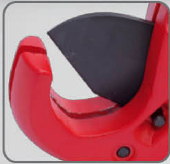
Stainless steel blade with special edge design for cutting.