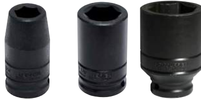
TYPE I TYPE II TYPE III