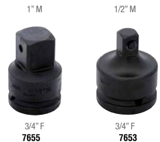
3/4" F 7655 3/4" F 7653