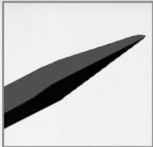
Diamond tip to facilitate concrete breakout.